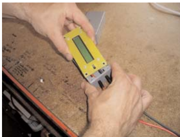
Step 7 Close unit up.