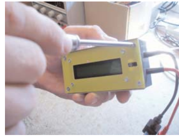
Step 2 Remove four screws.