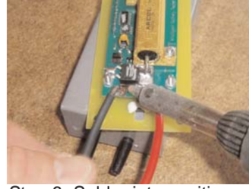
Step 6 Solder into position (WARNING: Observe polarity).