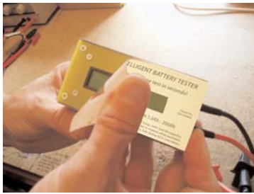
Step 1 Remove gold top label.

IMPORTANT: Re-calibration must be carried out by a competent person in accordance with the instructions below. NO LIABILITY ACCEPTED FOR DAMAGE OR INJURY CAUSED ONCE WORK IS UNDERTAKEN.