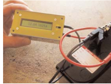
Step 8 Test, then fit screws and new labels.