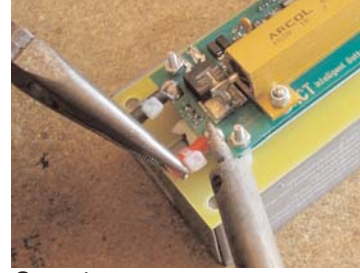
Step 4 De-solder lead ends.