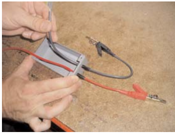
Step 5 Insert new leads.